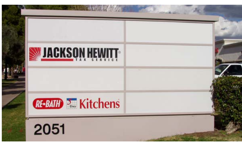
MONUMENT SIGNAGE AVAILABLE